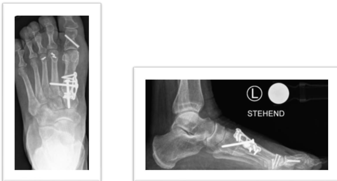
LAPIDUS SURGICAL TECHNIQUE

Moreover, I also saw his Lapidus technique for hallux valgus severe deformities, for hallux valgus revision surgery and for TMT joint instability, he taught us the biomechanical view of the disease and how must be the surgical approach and technique for the patient in order to correct instability in different axes, for me was very interesting to understand the correct indications to perform this surgery and the dorsomedial MEDARTIS plate is the one that he uses for this purpose, is different design than what we use in my hospital and I think is good think to start implementing for us.