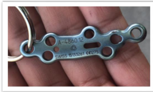
DORSOMEDIAL TMT PLATE (LAPIDUS PLATE) - MEDARTIS