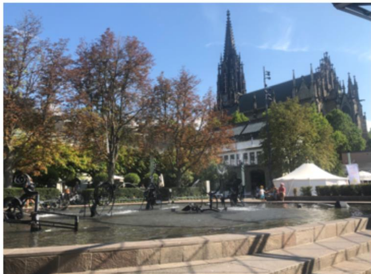
TINGUELY BRUNNEN – BASEL, SWITZERLAND